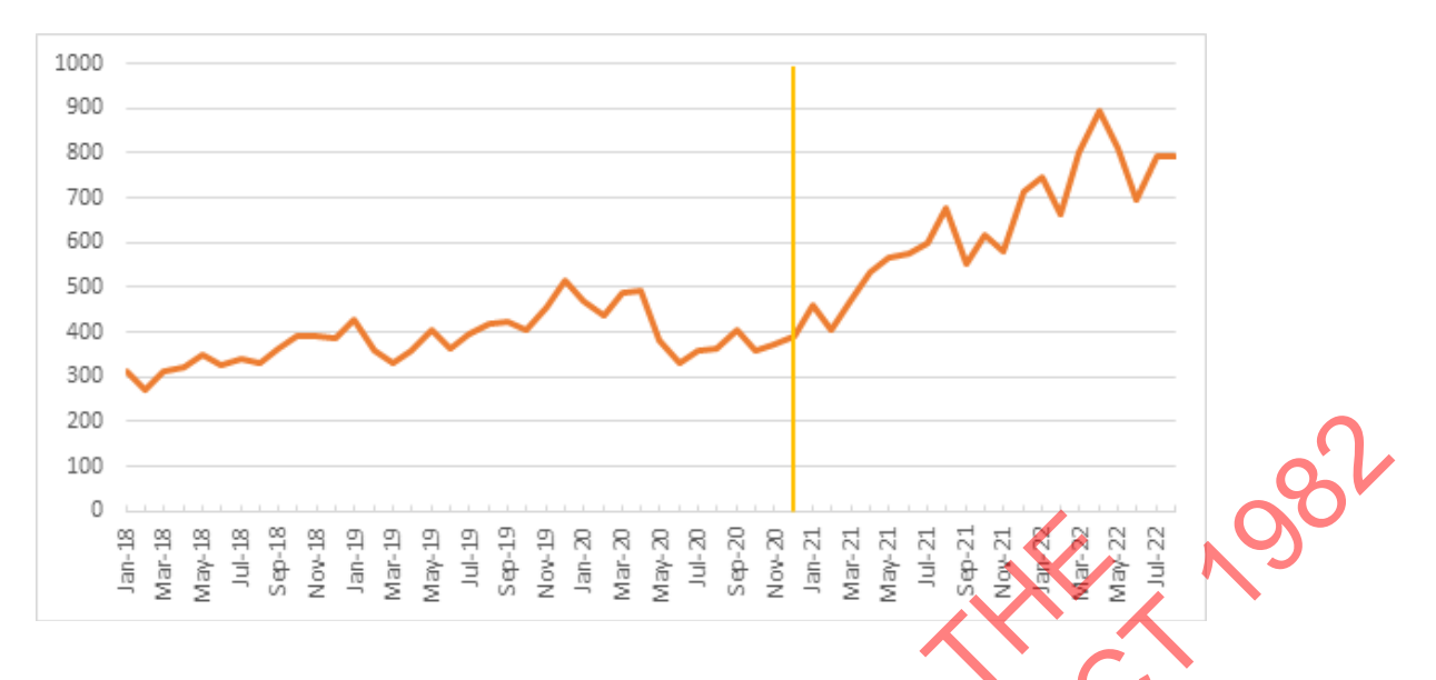
Table 3: fleeing driver events by month January 2018 – July 2022, NB: the yellow line marks the change in reporting practice