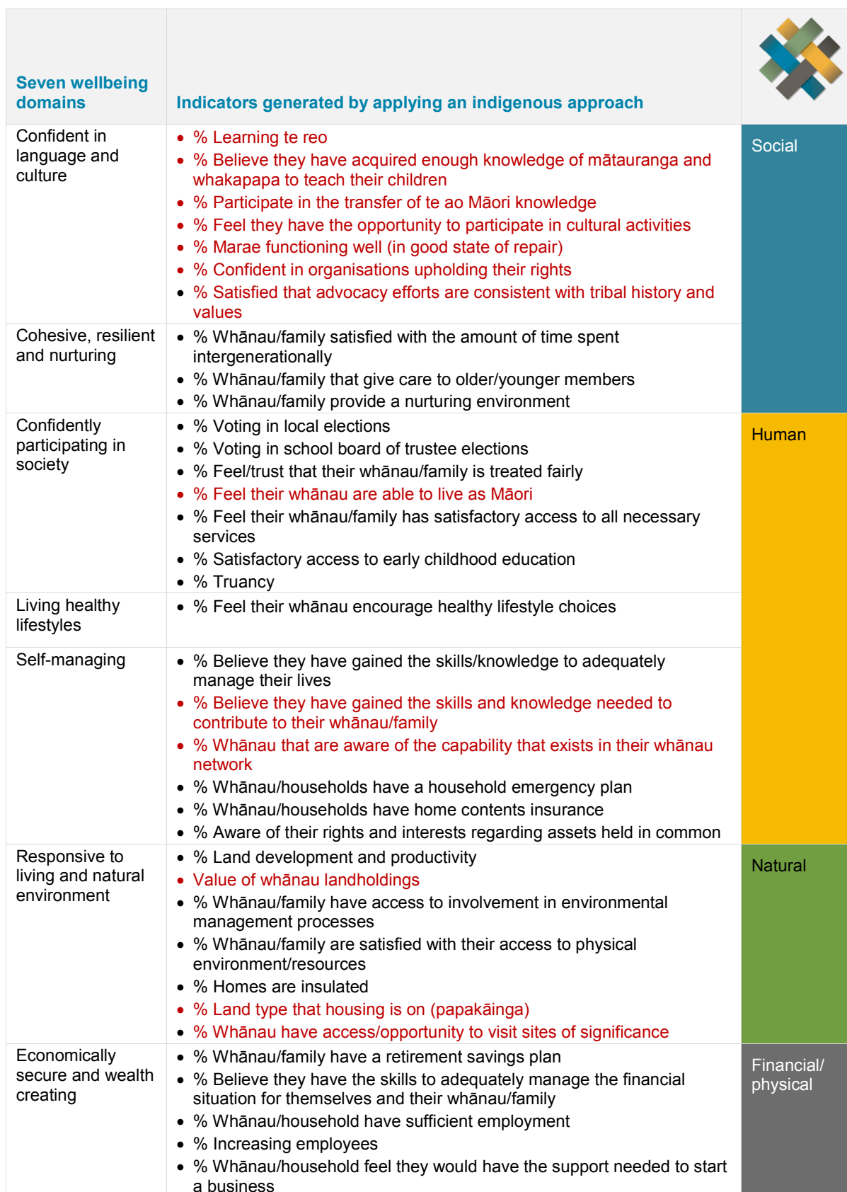
Table 1: Indicators generated by applying an indigenous approach

Note: Red signifies indicators that are Māori-specific rather than for the full population.