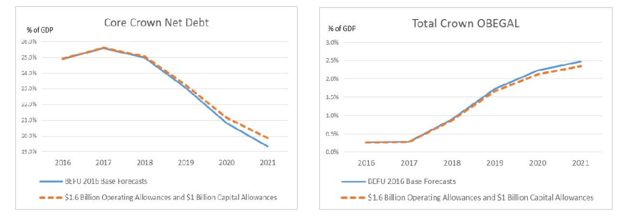
Figure 1: Increased Allowances that Keep Net Debt Below 20% of GDP by 2020/21